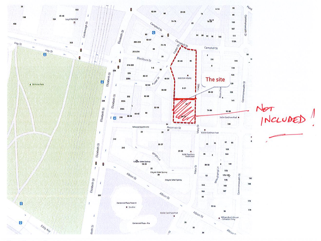
Figure 2 – Location plan